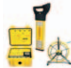
DIGISYSTEM™ Service Locator Tools